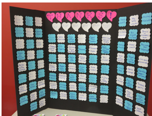
Donation & Supporter Thank You Board