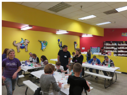
Artists in action!

FOW-USA would like to thank EVERYONE who supported this event and look forward to an even more successful Fundraiser in 2015.