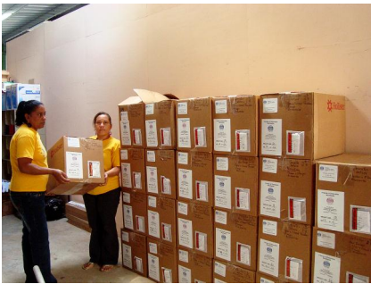
Ostomy Supplies arrived in Dominican Republic