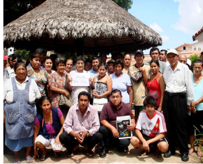
Bolivian Ostomates Thanking FOW-USA