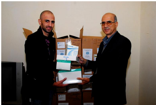
Lebanese ostomate receiving FOW-USA-donated supplies

President of The Lebanese Ostomy Association