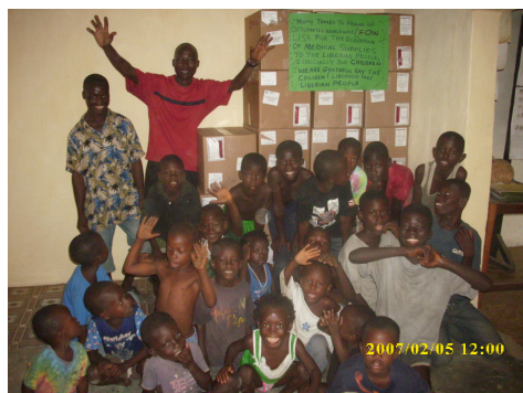
Liberia Rural Children's Organization