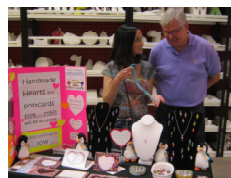
Pictured: L, shopper looking at glass hearts. R, family fun

Individuals and families enjoyed hours of painting fun and we had a short presentation from some of the Fundraiser Task Force members who were in attendance. We had donations of biddable gifts and financial donations come from this readership as well as from local businesses, families and friends. Just a sample of the prizes won were tickets to local sporting events, gift baskets, hand made knit good, art, and jewelry and much, much more. We can not thank you enough for making the event the success it was! Watch for an update in the Spring, 2015 edition and thank you ALL who made it possible.